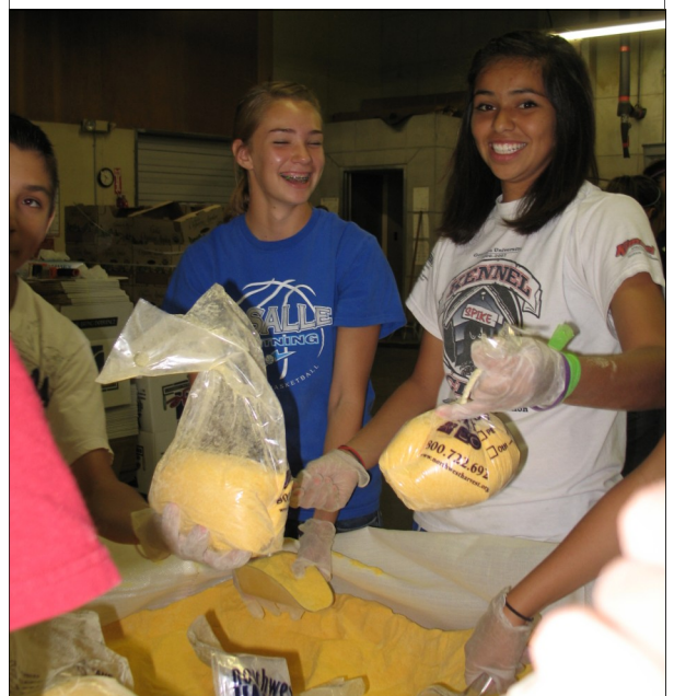
Freshmen repackage three tons of corn meal.