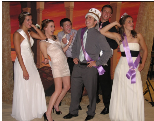
The 2010 Homecoming Court must have been thinking about a potential Follies act when they took their official picture.