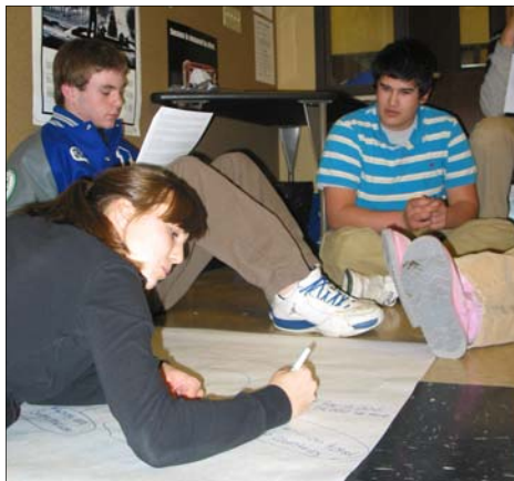
Sophomores prepare a presentation for their World History Class.

La Salle will recognize outstanding student achievement at the Academic Awards Assembly and the Senior Presentation. Freshmen, Sophomores and Juniors are recognized at the Awards Assembly Wednesday, May 28 at 7:00 PM in Lightning Hall. Notification for those receiving awards will be given to the students by mid-May. Seniors are recognized at the annual Senior Presentation on Monday, June 2 at 11:15 AM.