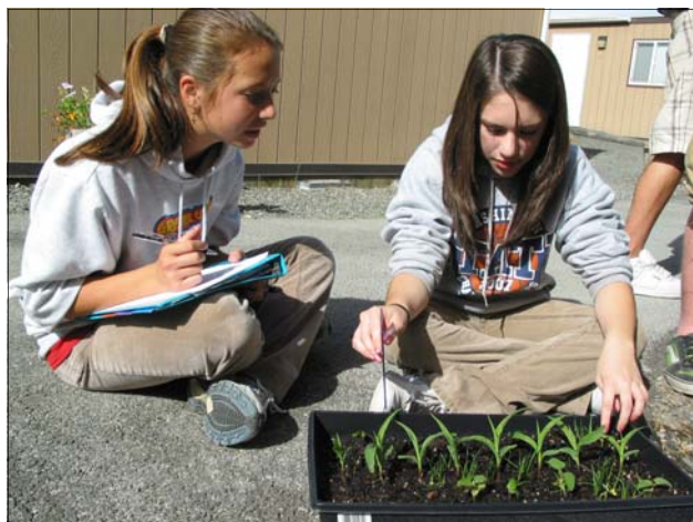
QUALITY EDUCATION IN ACADEMICS: SOPHOMORES COLLECTING DATA OF A BIOLOGY PROJECT RELATED TO THE PICK-A-THON.

POWERSCHOOL PROVIDES 24/7 ACCESS TO STUDENT GRADES AND MORE.