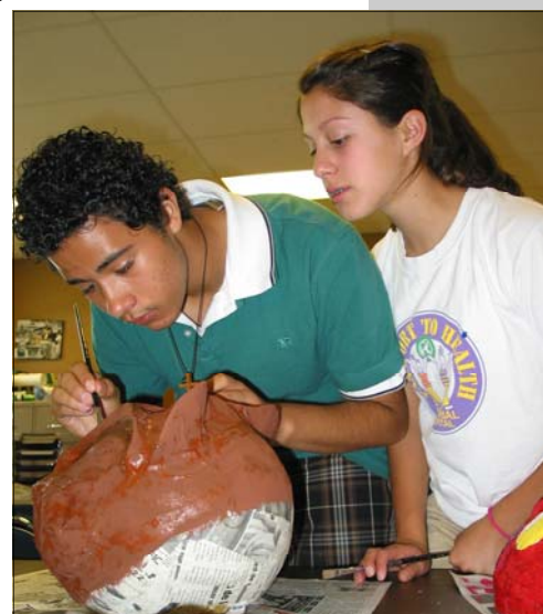
QUALITY EDUCATION IN THE ARTS: FRESHMEN WORK ON WASHINGTON STATE HISTORY MASK PROJECTS

OVER 35% OF OUR STUDENTS FAMILIES RECEIVE FINANCIAL ASSISTANCE FROM OUR GENEROUS DONORS WHO VALUE A QUALITY CATHOLIC EDUCATION